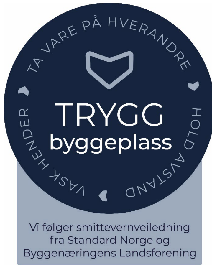
Figure 2 – Safe building site

Enterprises that undertake to follow the rules and implement the measures set out in this document may use the emblem shown in Figure 2.