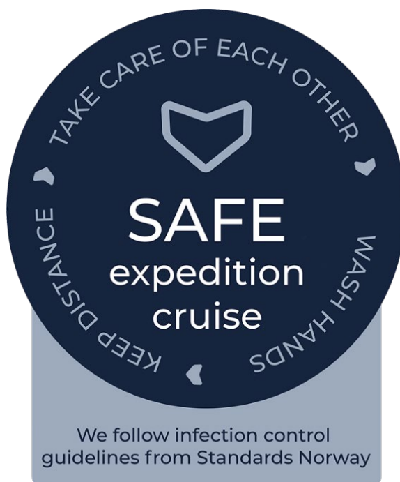
Figure 1 – Safe expedition cruise

Organizations that undertake to follow the rules and implement the measures set out in this document may use the emblem shown in Figure 1.